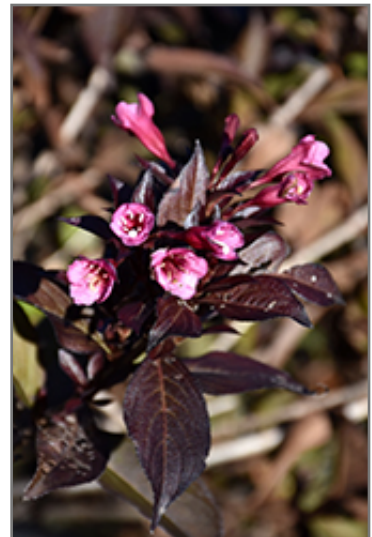
Fine Wine Weigela flowers