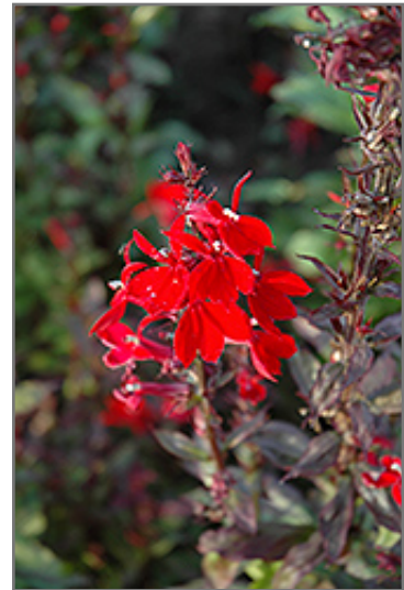
Queen Victoria Lobelia flowers