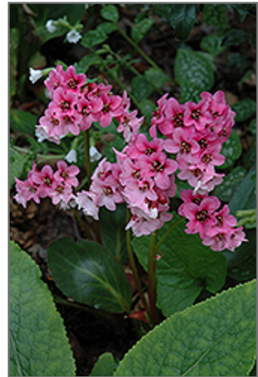
Pink Dragonfly Bergenia flowers