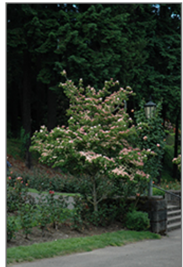
Heart Throb Chinese Dogwood in bloom