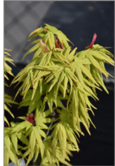
Mikawa Yatsubusa Japanese Maple foliage

Mikawa Yatsubusa Japanese Maple is recommended for the following landscape applications;