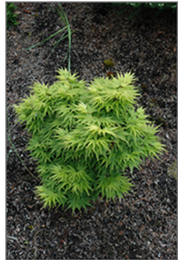
Mikawa Yatsubusa Japanese Maple

Mikawa Yatsubusa Japanese Maple is a fine choice for the yard, but it is also a good selection for planting in outdoor pots and containers. With its upright habit of growth, it is best suited for use as a 'thriller' in the 'spiller-thriller-filler' container combination; plant it near the center of the pot, surrounded by smaller plants and those that spill over the edges. It is even sizeable enough that it can be grown alone in a suitable container. Note that when grown in a container, it may not perform exactly as indicated on the tag - this is to be expected. Also note that when growing plants in outdoor containers and baskets, they may require more frequent waterings than they would in the yard or garden.