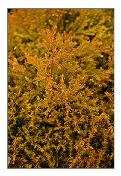
Fire Chief Arborvitae foliage

5129 S Emerson Ave. Indianapolis, IN 46237 www.dammannsgardenco.com