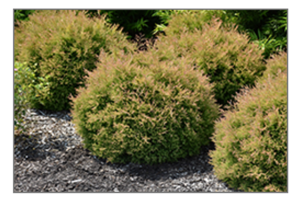
Fire Chief Arborvitae

Fire Chief Arborvitae will grow to be about 5 feet tall at maturity, with a spread of 5 feet. It tends to fill out right to the ground and therefore doesn't necessarily require facer plants in front, and is suitable for planting under power lines. It grows at a slow rate, and under ideal conditions can be expected to live for approximately 30 years.