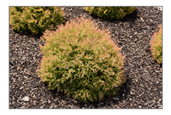
Fire Chief Arborvitae

Fire Chief Arborvitae is recommended for the following landscape applications;