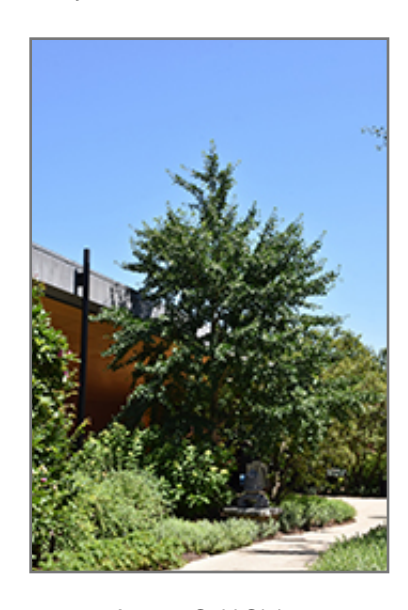
Autumn Gold Ginkgo