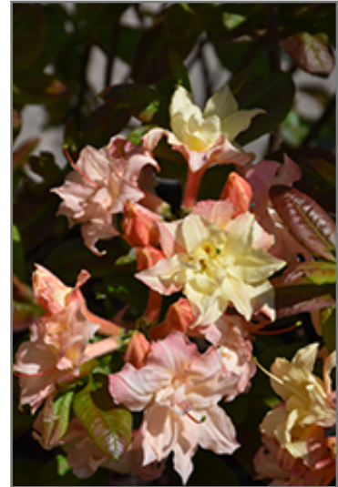
Cannon's Double Azalea flowers