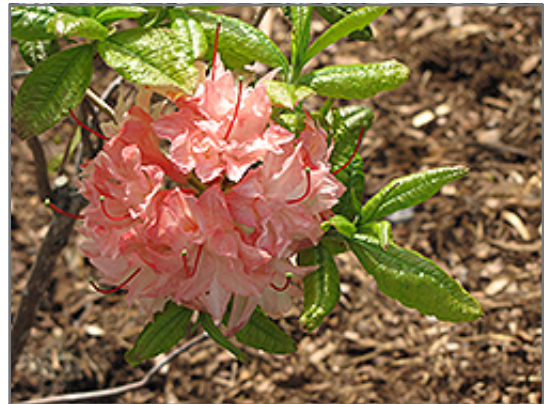
Cannon's Double Azalea flowers