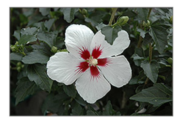
Lil' Kim Rose of Sharon flowers

5129 S Emerson Ave. Indianapolis, IN 46237 www.dammannsgardenco.com