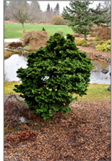
Dwarf Hinoki Falsecypress