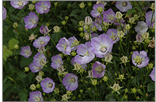
Samantha Bellflower flowers