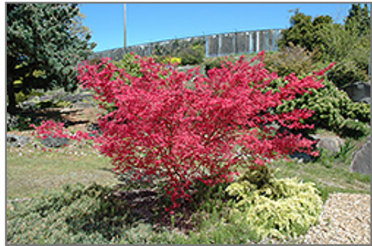
Shindeshojo Japanese Maple in spring

This tree does best in full sun to partial shade. You may want to keep it away from hot, dry locations that receive direct afternoon sun or which get reflected sunlight, such as against the south side of a white wall. It prefers to grow in average to moist conditions, and shouldn't be allowed to dry out. It is not particular as to soil pH, but grows best in rich soils. It is somewhat tolerant of urban pollution, and will benefit from being planted in a relatively sheltered location. Consider applying a thick mulch around the root zone in winter to protect it in exposed locations or colder microclimates. This is a selected variety of a species not originally from North America.