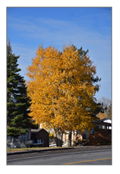
Clump Paper Birch in fall