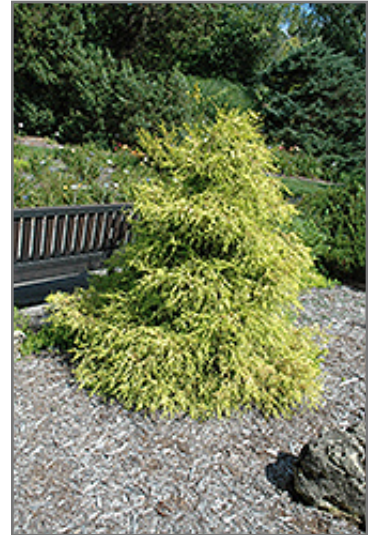
Lemon Thread Falsecypress

Lemon Thread Falsecypress is recommended for the following landscape applications;