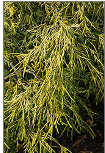
Lemon Thread Falsecypress foliage