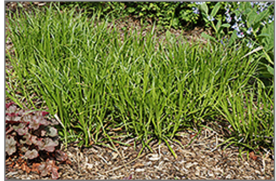
Gray's Sedge