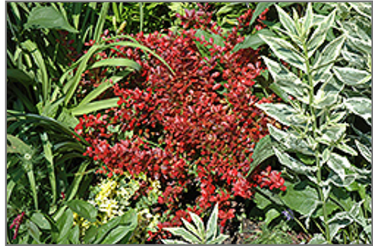
Cherry Bomb Japanese Barberry

Cherry Bomb Japanese Barberry is recommended for the following landscape applications;