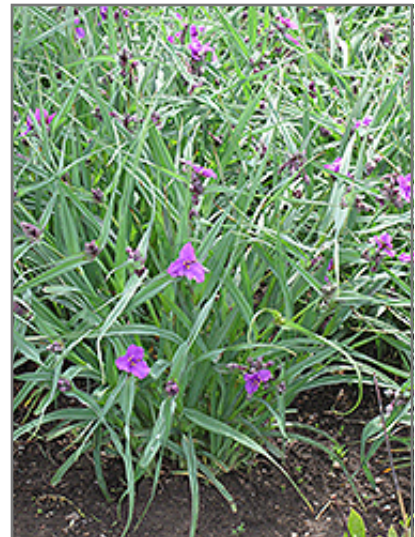
Concord Grape Spiderwort in bloom