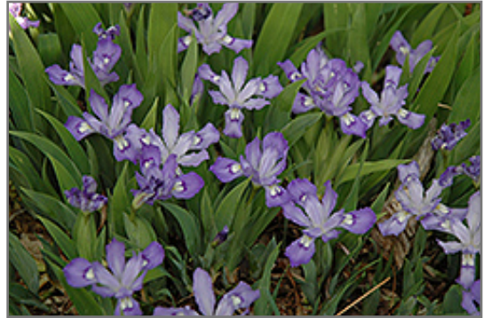
Dwarf Crested Iris flowers