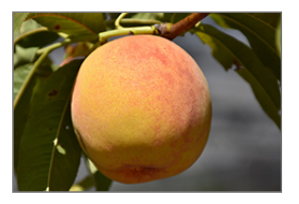
Reliance Peach fruit

5129 S Emerson Ave. Indianapolis, IN 46237 www.dammannsgardenco.com