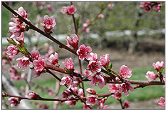
Reliance Peach flowers