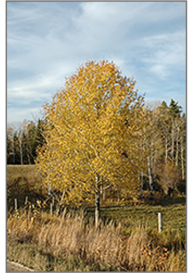
Trembling Aspen in fall

This tree should only be grown in full sunlight. It is an amazingly adaptable plant, tolerating both dry conditions and even some standing water. It is considered to be drought-tolerant, and thus makes an ideal choice for xeriscaping or the moisture-conserving landscape. It is not particular as to soil type or pH. It is quite intolerant of urban pollution, therefore inner city or urban streetside plantings are best avoided. This species is native to parts of North America.