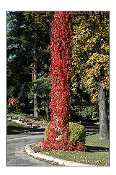
Virginia Creeper in fall

5129 S Emerson Ave. Indianapolis, IN 46237 www.dammannsgardenco.com