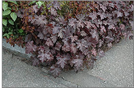
Stormy Seas Coral Bells

Stormy Seas Coral Bells is recommended for the following landscape applications;