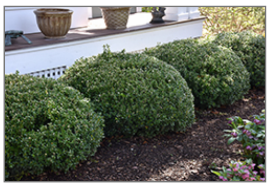
Sprinter Boxwood

This shrub does best in full sun to partial shade. You may want to keep it away from hot, dry locations that receive direct afternoon sun or which get reflected sunlight, such as against the south side of a white wall. It prefers to grow in average to moist conditions, and shouldn't be allowed to dry out. It is not particular as to soil type or pH. It is highly tolerant of urban pollution and will even thrive in inner city environments, and will benefit from being planted in a relatively sheltered location. This is a selected variety of a species not originally from North America.