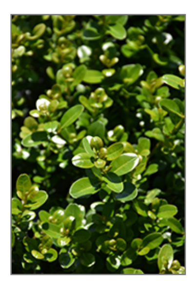
Sprinter Boxwood foliage

5129 S Emerson Ave. Indianapolis, IN 46237 www.dammannsgardenco.com