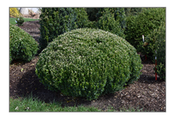
Sprinter Boxwood

Sprinter Boxwood is recommended for the following landscape applications;