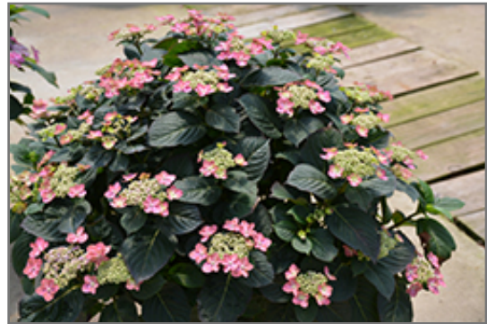
Tuff Stuff Red Hydrangea in bloom