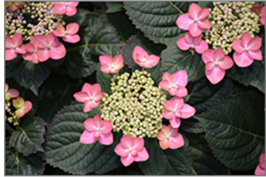
Tuff Stuff Red Hydrangea flowers