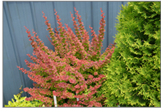
Sunjoy Tangelo Japanese Barberry

Sunjoy Tangelo Japanese Barberry will grow to be about 4 feet tall at maturity, with a spread of 4 feet. It tends to fill out right to the ground and therefore doesn't necessarily require facer plants in front. It grows at a medium rate, and under ideal conditions can be expected to live for approximately 20 years.