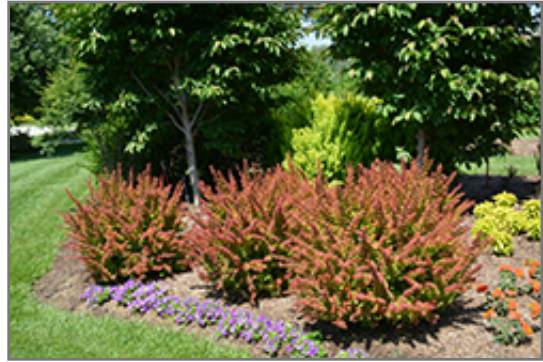
Sunjoy Tangelo Japanese Barberry

Sunjoy Tangelo Japanese Barberry is recommended for the following landscape applications;