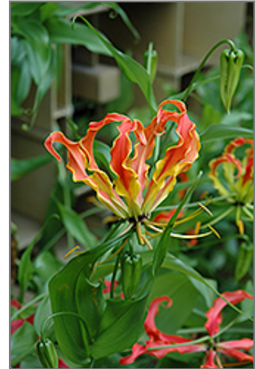
Gloriosa Lily flowers

This is a multi-stemmed houseplant with a spreading, ground-hugging habit of growth. This plant may benefit from an occasional pruning to look its best.