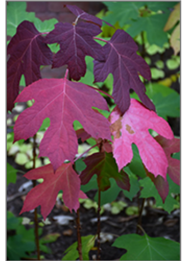
Oakleaf Hydrangea in fall

This shrub performs well in both full sun and full shade. It prefers to grow in average to moist conditions, and shouldn't be allowed to dry out. It is not particular as to soil type or pH. It is somewhat tolerant of urban pollution, and will benefit from being planted in a relatively sheltered location. Consider applying a thick mulch around the root zone in winter to protect it in exposed locations or colder microclimates. This species is native to parts of North America.