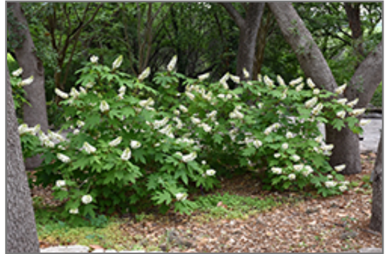
Oakleaf Hydrangea in bloom