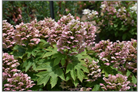
Oakleaf Hydrangea flowers (faded)