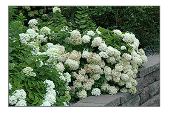
Pee Gee Hydrangea in bloom

5129 S Emerson Ave. Indianapolis, IN 46237 www.dammannsgardenco.com