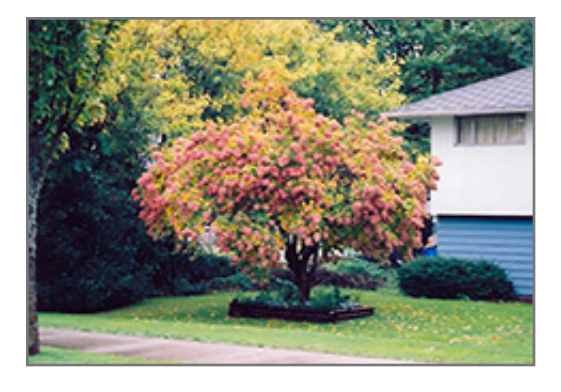
Pee Gee Hydrangea in bloom