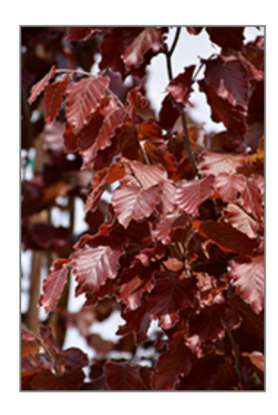
Red Obelisk Beech foliage