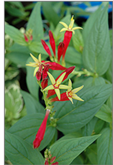
Indian Pink flowers

Indian Pink is recommended for the following landscape applications;