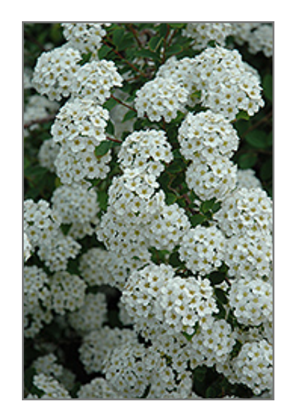
Renaissance Spirea flowers