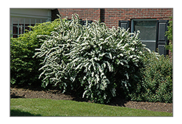
Renaissance Spirea in bloom

5129 S Emerson Ave. Indianapolis, IN 46237 www.dammannsgardenco.com