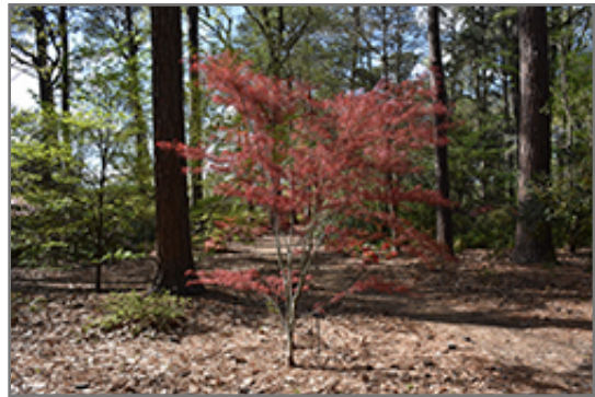
Hubb's Red Willow Japanese Maple