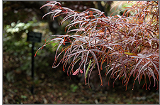
Hubb's Red Willow Japanese Maple foliage

Hubb's Red Willow Japanese Maple is recommended for the following landscape applications;