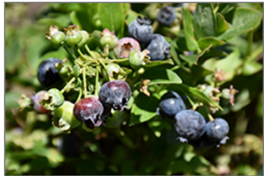
Jelly Bean Blueberry fruit