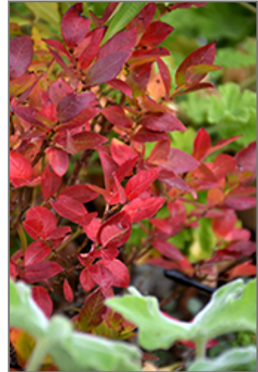
Jelly Bean Blueberry in fall

Jelly Bean Blueberry features dainty clusters of white bell-shaped flowers with shell pink overtones hanging below the branches in mid spring. It has red-variegated green foliage. The glossy oval leaves turn an outstanding red in the fall. It features an abundance of magnificent blue berries in mid summer.