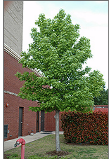
Happidaze Sweet Gum

This tree should only be grown in full sunlight. It prefers to grow in average to moist conditions, and shouldn't be allowed to dry out. It is very fussy about its soil conditions and must have rich, acidic soils to ensure success, and is subject to chlorosis (yellowing) of the foliage in alkaline soils. It is somewhat tolerant of urban pollution. This is a selection of a native North American species.