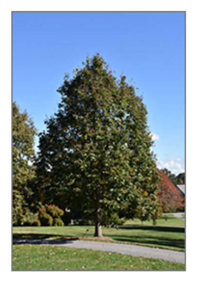
Redmond Linden

5129 S Emerson Ave. Indianapolis, IN 46237 www.dammannsgardenco.com