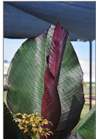
Red Banana foliage