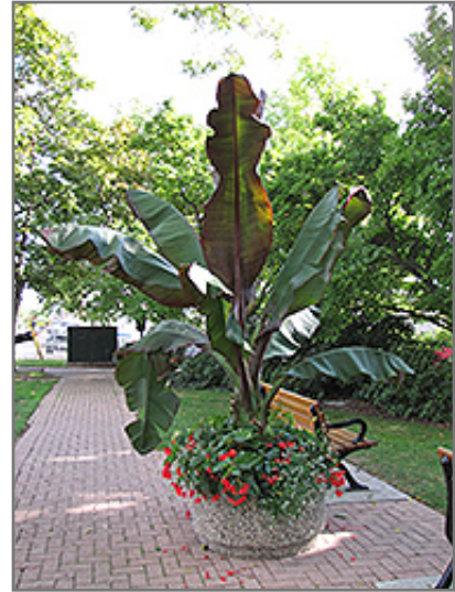
Red Banana

Red Banana is a fine choice for the garden, but it is also a good selection for planting in outdoor pots and containers. Its large size and upright habit of growth lend it for use as a solitary accent, or in a composition surrounded by smaller plants around the base and those that spill over the edges. It is even sizeable enough that it can be grown alone in a suitable container. Note that when growing plants in outdoor containers and baskets, they may require more frequent waterings than they would in the yard or garden.