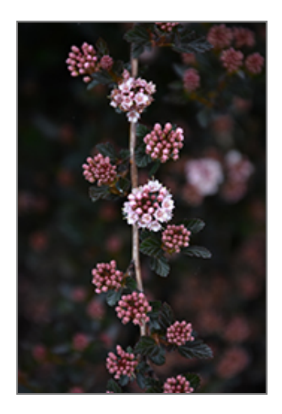
Little Devil Ninebark flowers

5129 S Emerson Ave. Indianapolis, IN 46237 www.dammannsgardenco.com