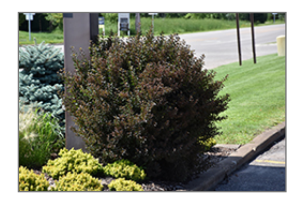
Little Devil Ninebark

Little Devil Ninebark is recommended for the following landscape applications;