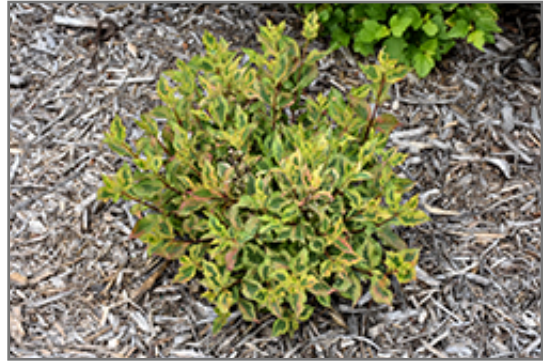
Rainbow Sensation Weigela

Rainbow Sensation Weigela makes a fine choice for the outdoor landscape, but it is also well-suited for use in outdoor pots and containers. Because of its height, it is often used as a 'thriller' in the 'spiller-thriller-filler' container combination; plant it near the center of the pot, surrounded by smaller plants and those that spill over the edges. It is even sizeable enough that it can be grown alone in a suitable container. Note that when grown in a container, it may not perform exactly as indicated on the tag - this is to be expected. Also note that when growing plants in outdoor containers and baskets, they may require more frequent waterings than they would in the yard or garden.